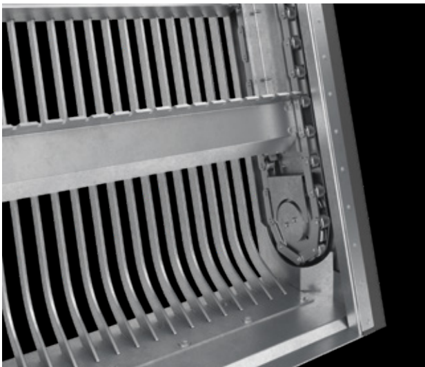
Curved bars at the bottom for higher capacity and optimum material conveying.

It's used in pumping stations, water intakes, waste water treatment plants. Conveyor chain drive with multiple rakes gives fast cleaning cycles giving high flow and conveying capacities.